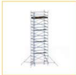
STEEL MOBILE TOWER