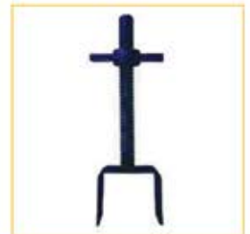
U JACK (STIRRUP HEAD)