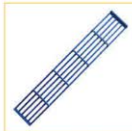
MS PLATFORM (JAALI)