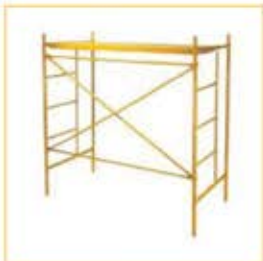
H - FRAME